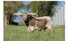
BLACK HEAD BOGIA