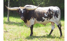
Horseshoe J Charm