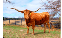
BL Coach's Desperado